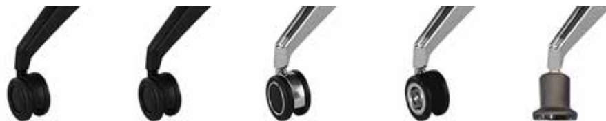
Black Dual Wheel Carpet Caster (BCC)