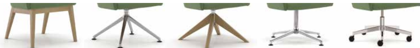
4-Leg Wood Base (SN4L)