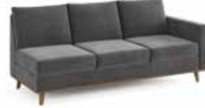
Sofa with 1 Arm #6203L or #6203R (shown)