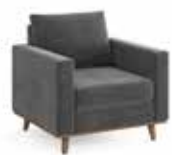
Club Chair #620