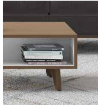
Table Cabinet Accents: Create an unexpected detail or add a touch of color by specifying the optional Cabinet HPL Accent on a variety of our Plush Veneer Table options.

Contrasting Colors: Personalize Plush through a variety of options, including selecting contrasting finishes for the Plinth Accent and Wood Leg or contrasting upholstery on the seat/back and arms/surround.