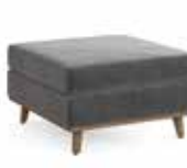
31"x33" Ottoman #620-3133OT