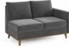
Settee with 1 Arm #6202L or #6202R (shown)