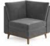
Corner Unit #620-90C