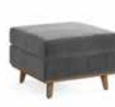
26" Square Ottoman #620-2626OT