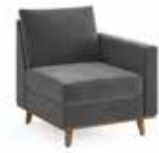
Club Chair with 1 Arm #620L or #620R (shown)