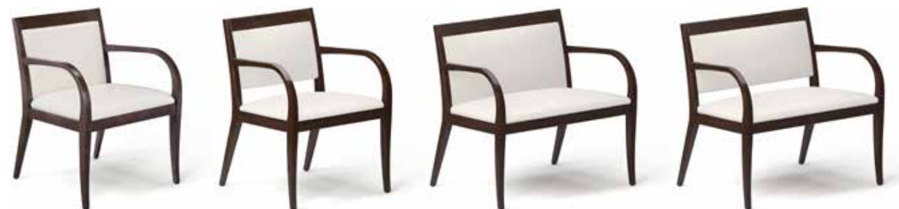
Curved Arm, Fully Upholstered Model #396