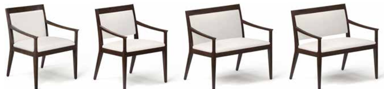
Swoop Arm, Fully Upholstered Model #398