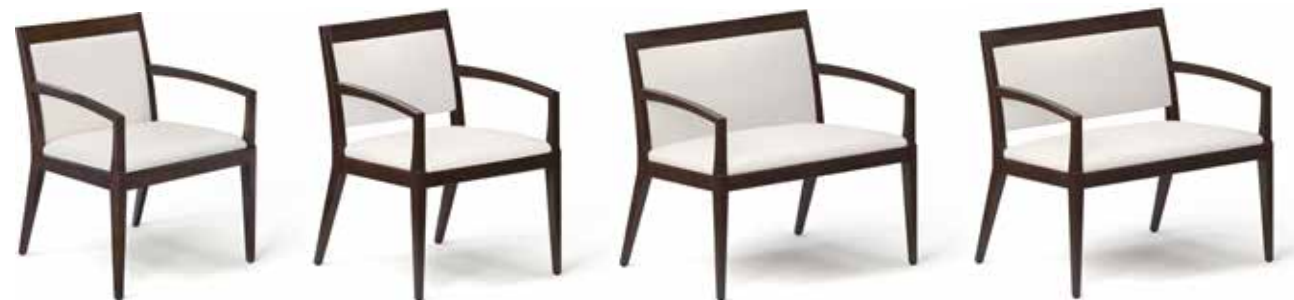
Arch Arm, Fully Upholstered Model #395