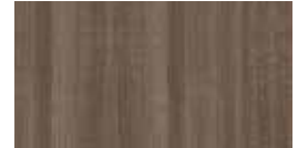
Studio Teak (TK) TFL, HPL