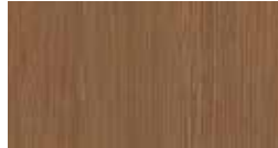
Mesa Sunset (MAS) Veneer*