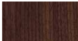
Columbian Walnut (CO) Veneer, TFL, HPL