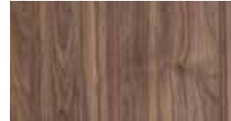
Natural Marrone (NTM) TFL, HPL