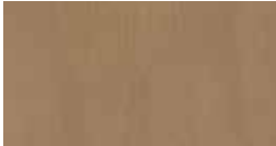
Fawn Oak (FO) Veneer*