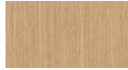
Oak Riftwood (ORW) Veneer*, TFL, HPL