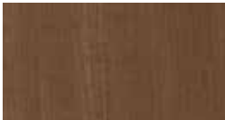
Pinnacle Walnut (PNW) Veneer, TFL, HPL