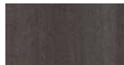
Smoky Brown Pear (SBP) TFL, HPL