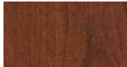
Williamsburg Cherry (WC) Veneer, TFL, HPL