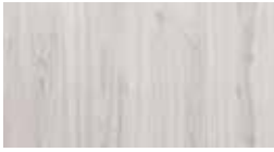
White Nebbia (WNB) TFL, HPL