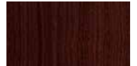
Mahogany Walnut (MW) Veneer, HPL