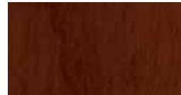
Dark Cherry (DC) Veneer