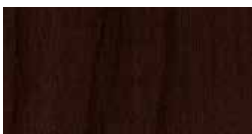
Espresso (EW/EF) Veneer, TFL, HPL