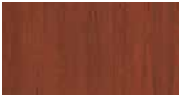
Select Cherry (SCH) Veneer, HPL