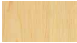
Sugar Maple (SM) Veneer, TFL, HPL