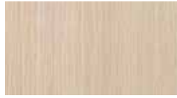
Beigewood (BW) TFL, HPL