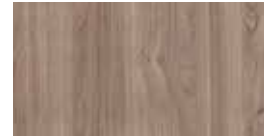
Kirsche (KHE) TFL, HPL