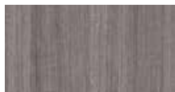
Portico Teak (PTK) TFL, HPL