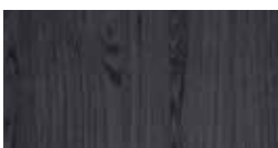
Midnight Run (MNR) TFL, HPL