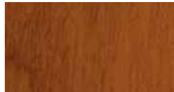
Golden Cherry (GC) Veneer, HPL