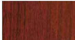
Harvest Walnut (HW) Veneer