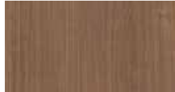
River Cherry (RC) TFL, HPL