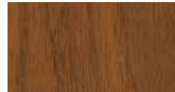
Artisan Walnut (AW) Veneer