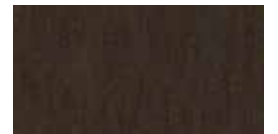
Dark Forest Walnut (DFW) Veneer